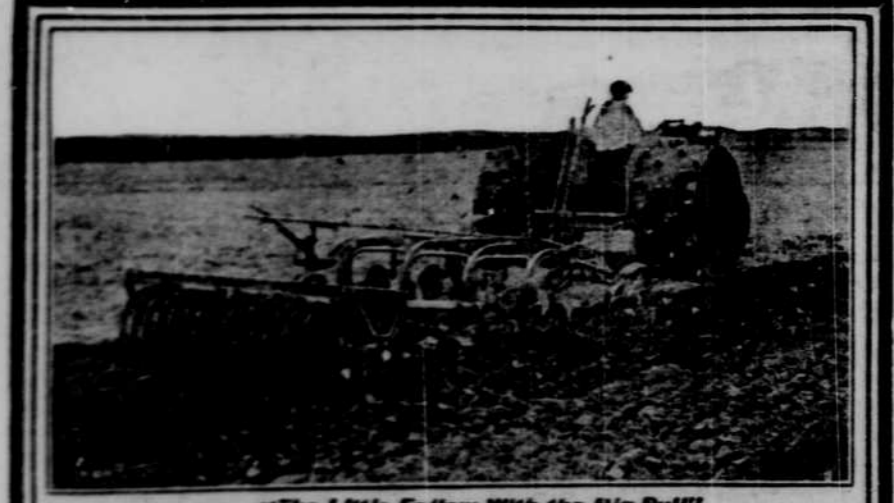
"The Little Fellow With the Big Pull!" Four 14-in. plows, 9 in. deep, plus sub-surface packer in KANSAS STUBBLE