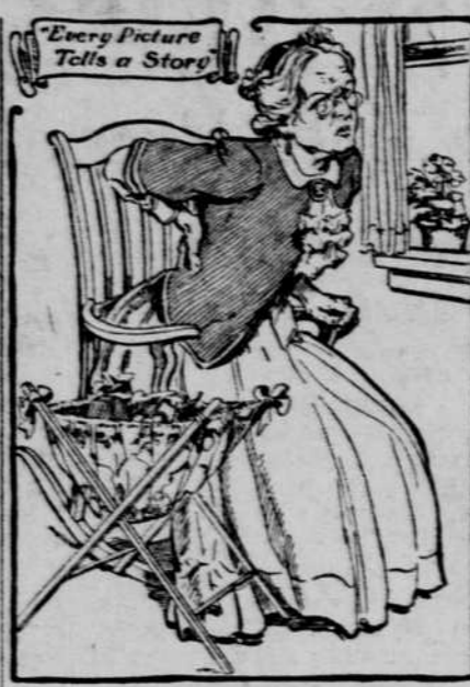
"I don't know what ails me."

Real torture begins when the uric acid forms into gravel or stone in the kidney, or crystallizes into jagged bits in the muscles, joints or on the nerve tubings. Then follow the awful pains of neuralgia, rheumatism, gout, sciatica, neuritis, lumbago or kidney colic.