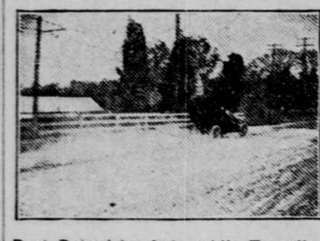
Dust Raised by Automobile Traveling at High Speed.

The most important problem which has confronted highway engineers in recent years is the getting rid of the dust on roads. Not until the introduction of motor vehicles, however, did this become a factor of sufficient importance to engage the serious consideration of road builders and road users. Fast motor traffic has reached such proportions at the present time as to shorten the life of our most carefully constructed and expensive