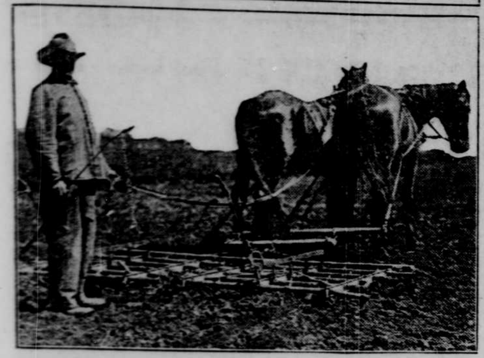
Work Horses-Work Them Carefully in the Spring Time, Until Their Muscles Get Right.