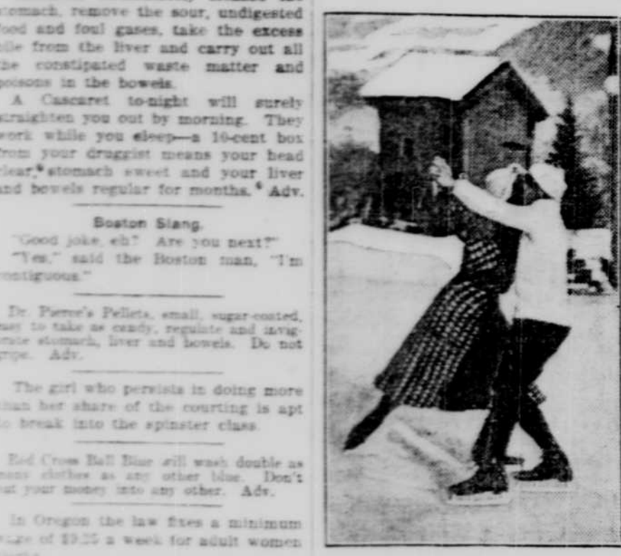
Dancing on the Ice.

that there is real pleasure in contemplating this array of coats and mufflers which make so fine a show on every available counter