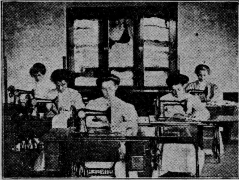
Machine Sewing Class in a County School.

Formerly when free land was abundant and the soil fertile, little difficulty was experienced in the growing of crops. At that time, also, practically all the food and much of the clothing used by the farmer and his family were produced in the home.