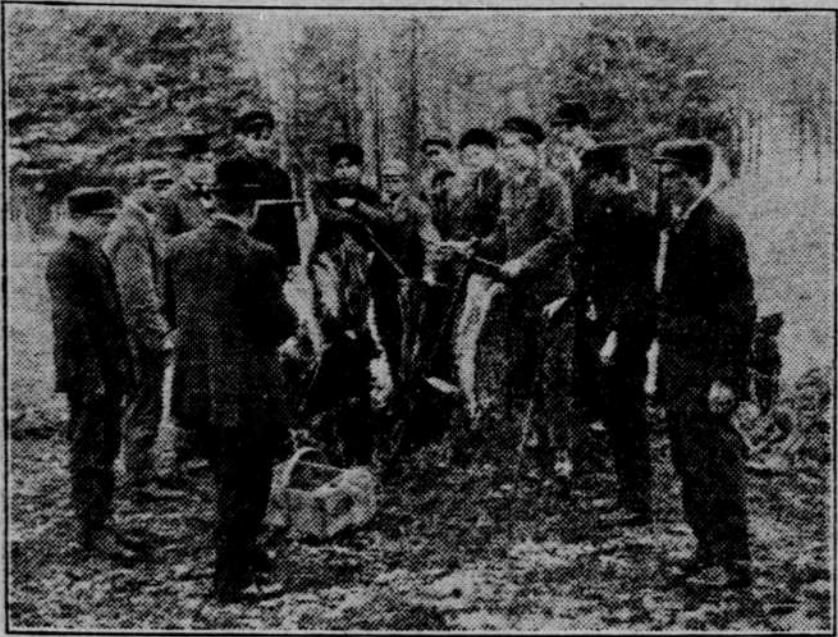
Students Removing Stumps With Dynamite.

PROBABLY no movement in education has received as much attention in the past few years as that which pertains to the practical phases of farming and home making.