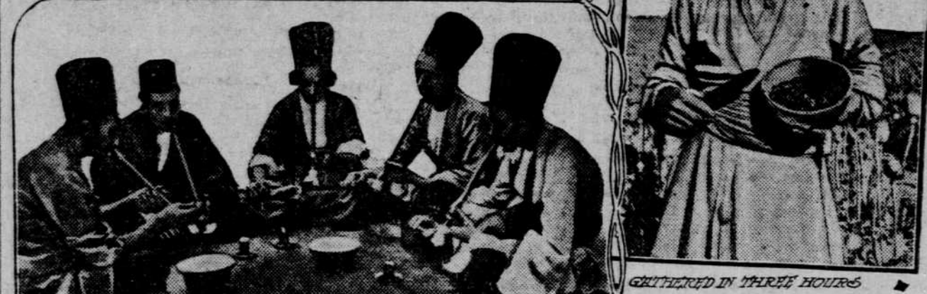
Opium smokers in a Persian tea house.