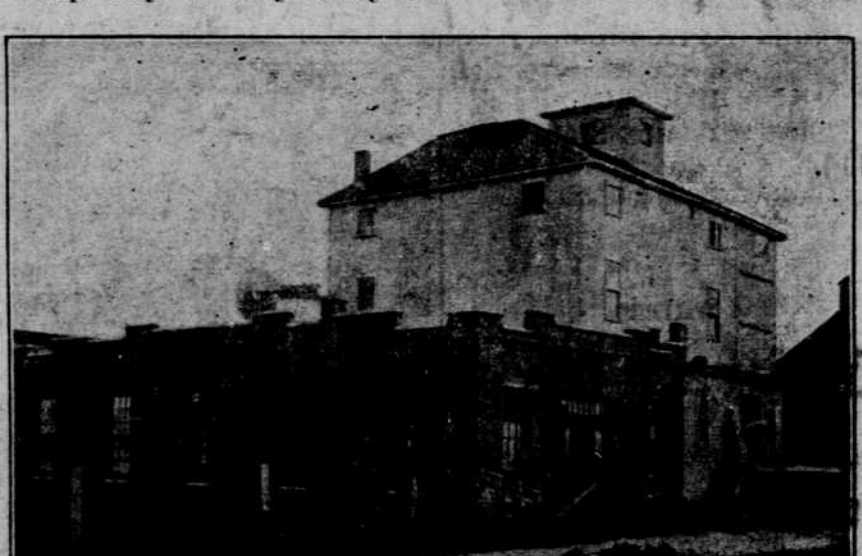
Mill and Electric Light Plant, Loup City, Nebraska

mate healthy and invigorting. Another new financial industry Loup City is today a city of that has recently been established