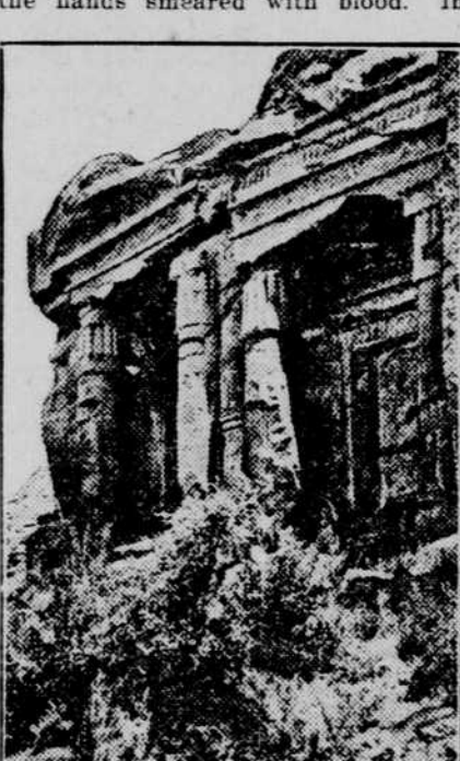
Ruined Temple Where Once the Goddess Kail Was Worshipped.