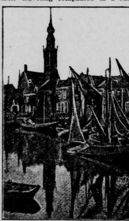
Fishing Fleet on Dutch Canal.

other ways. See the people's faces light up in smiles when they hear that their traveling companion in a rail-