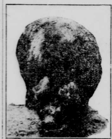
Prize Winning Boar.

with their hogs mixing with their child labor legislation in Illinois, neighbors' hogs, since the mulefoot is easy to tell from any other breed on account of their solid feet. For this reason I advise breeders not to sell to any of their immediate neighbors if possible. This one point is worth hundreds of dollars in case of disputes about hogs when they get mixed. Since there are so few herds in the country it prevents any one driving off your hogs if you have this The American Mulefoot Hog Record breed. A great many suppose that