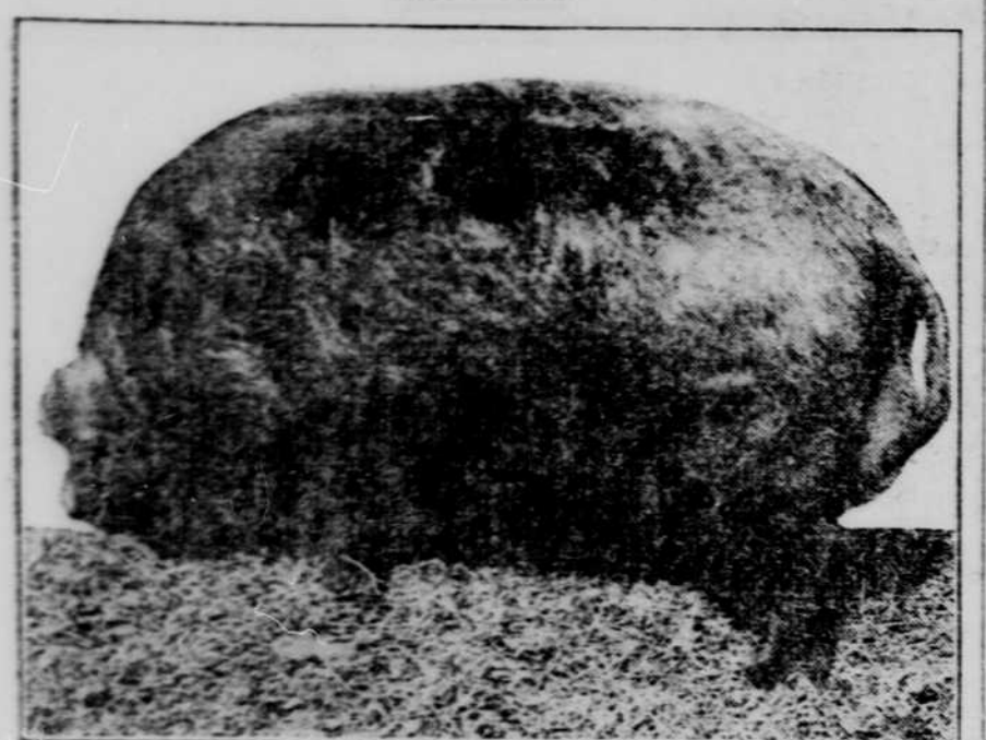
Grand Champion Mulefoot Boar.

Fuil Blooded Animal as Large as Any of Other Breeds When Given Same Attention-Sows are Gentle, Kind Mothers and Usually Raise Large Litters of Pigs-Demand Is Large.