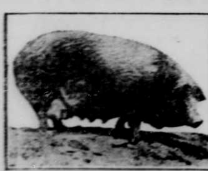
Grand Champion Mulefoot Sow.

the United States department of agriculture. It seems that the government has never been able to find out foot to assert itself with a solid foot plied as a fertilizer. From 200 to 500 still puzzling the experts.