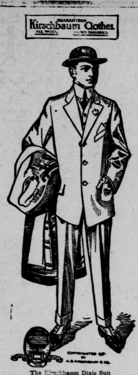
The Kirschbaum Dixie Suit