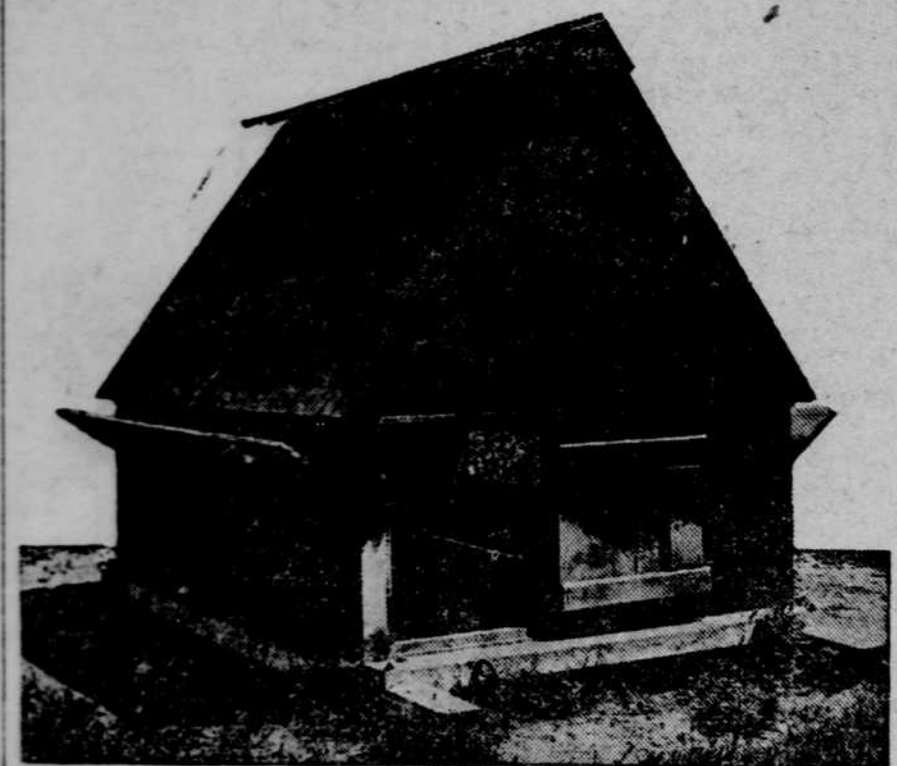
A Desirable Hog Cot.

There is No Theme Upon Farm That Will So Benefit Farmer as to Keep Quarters and Surroundings in Sanitary Condition Where Hogs are Kept—Guard Against Cholera.