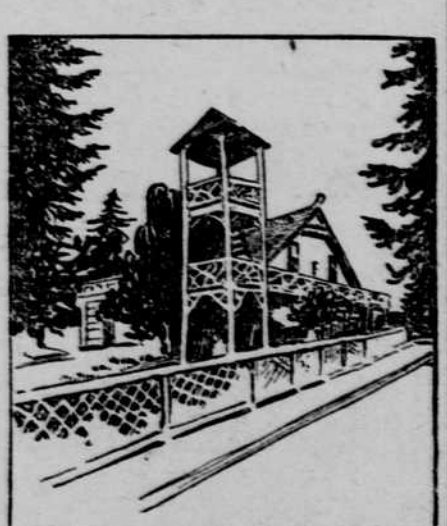
No Nails in This House.

Portland, Ore.-This novel house. the like f which does not exist in the country, was begun as a cabin in you are going, and what you are going 1887. From a single room with low there for. ceiling it has grown until it is now a good sized house of many rooms. The driftwood was gathered and worked into building material by unskilled hands, and later the furniture was made and the fences built of the same