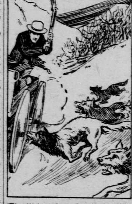
Wolves Soon Caught Up With

"Late in the afternoon" he says "I gave up and turned back. I had gone but a short distance when I heard the howling of wolves. I hurried through