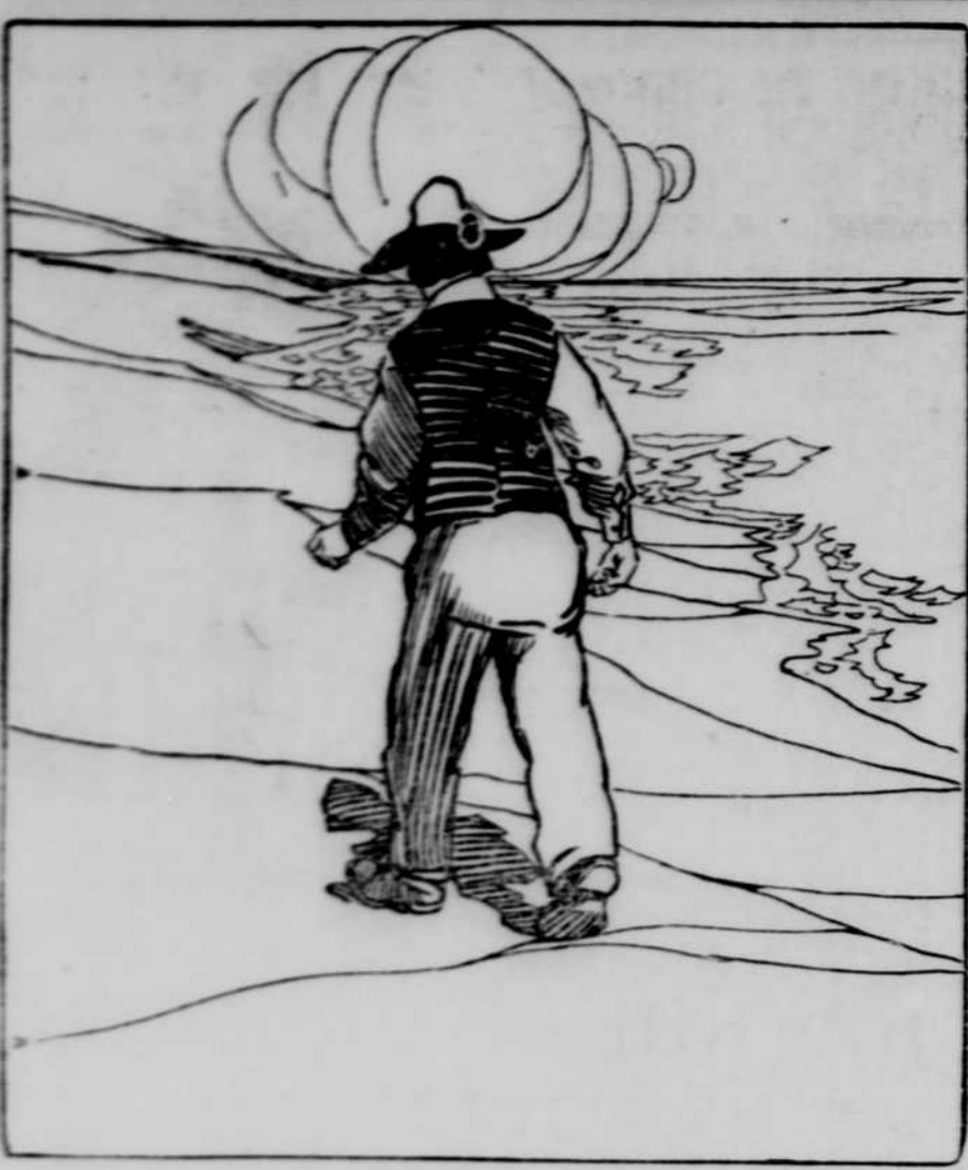
For Hours He Trod Steadily Through the Sand.