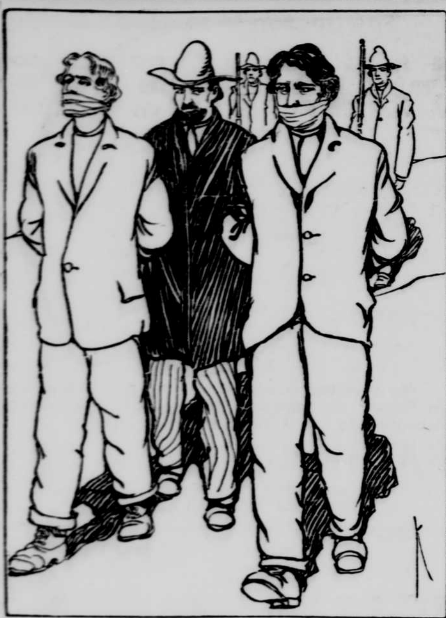
"Don't Give Up Hope—Marion—Win some!"