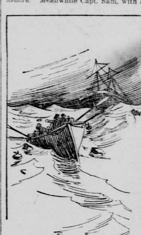
Rescuing a Stranded Crew.

The seas that broke over her parted "It is not that I object to losing the | the line to the station power boat and