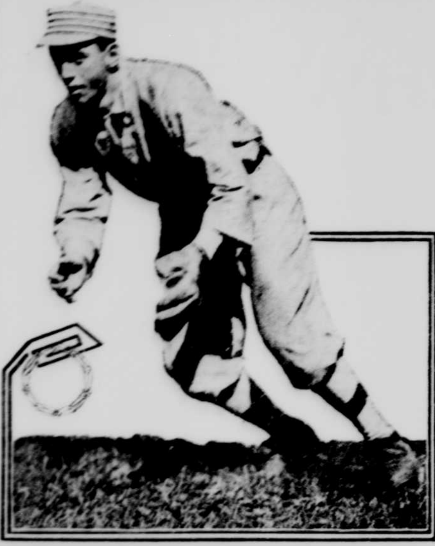
Jack Barry of Athletics