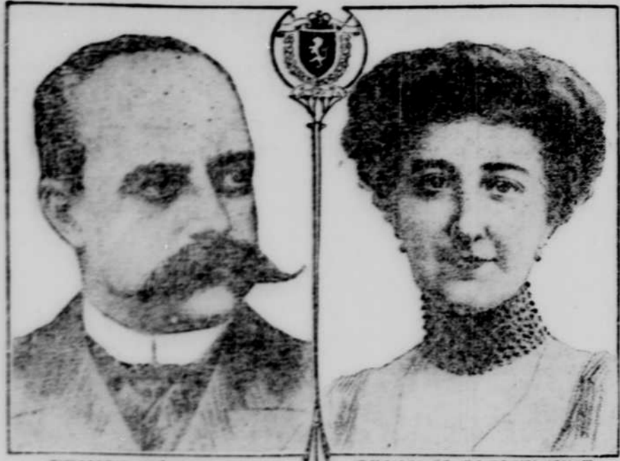
PRINCE VICTOR NAPOLEON PRINCESS CLEMENTINE OF BELGIUM

ONE of the most interesting of the marriage engagements announced in Europe in some years is that of Prince Victor Napoleon, pretender to the French throne, and Princess Clementine of Belgium.