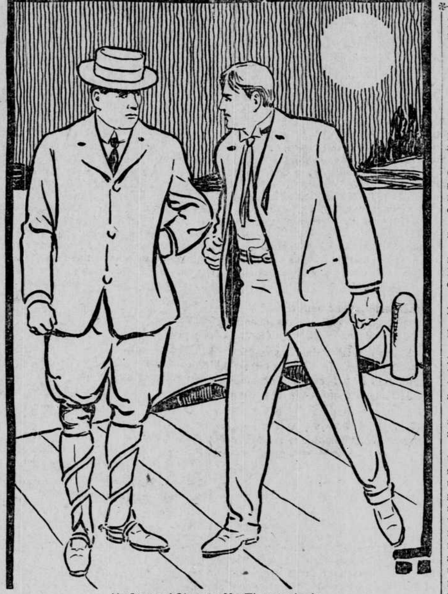
He Stepped Close to Me Threateningly.