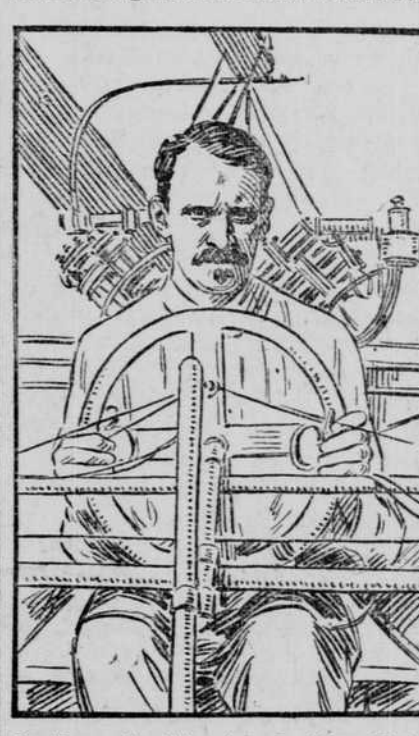
There is a scarcity of workmen in of Nebraska university medical staff old-80 or thereabouts-may be lucky for a period of seven years. He had Curtiss at Whee! of His Flying

Machine one minute 42 seconds. He was only Characterized by his following as a required to go one kilometer, .621 of