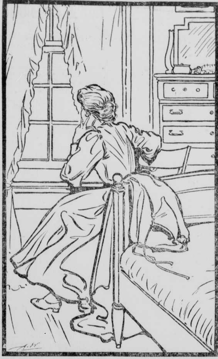
She Had Watched the House from the Window of a Top-Floor Hall Bedroom in the Boarding-House Opposite.