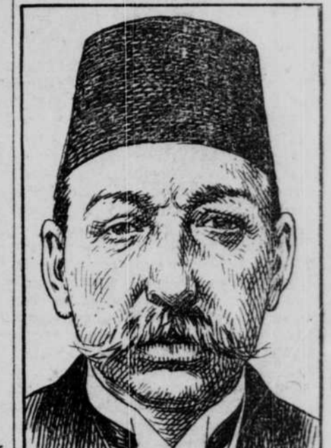
Mohammad V., New Sultan of Turkey.