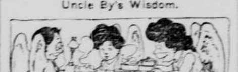
Uncle By's Wisdom.

The Awakening. The guided, all dreamed in sun. Dimple yellow with the morning's dew. The brown-eyed Beauty's presence.