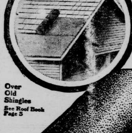
Over Old Shingles See Roof Book Page 5