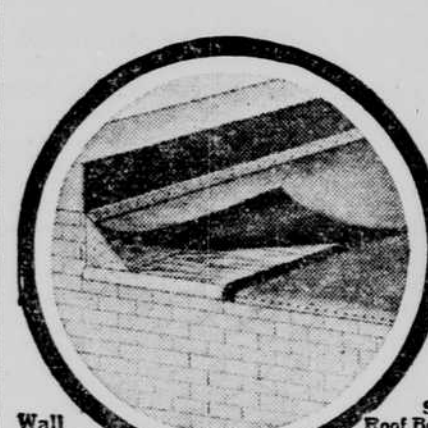
Wall Flashing See Roof Book Page 13

HARDWARE AND LUMBER DEALERS can make profitable connections with us in towns where we have no distributors. Write. Goods shipped from our warehouses at all principal Railroad distributing centers, making possible quick deliveries and low freight.