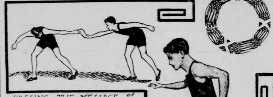
PASSING THE MESSAGE

REMARKABLE NEW YORK-CHICAGO RELAY RACE BY Y.M.C.A. BOYS.