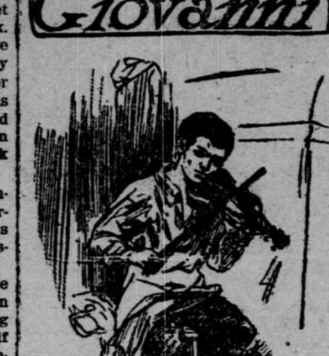
Played to His Heart's Content.

A grand French nobleman was once raveling quietly through Italy, accompanied only by his secretary.