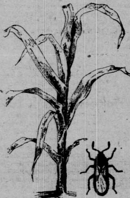
Corn Plant Two Feet Tall Infested with Chinch Bugs.

Few insects, and certainly no other | serious injury to the latter; but the these are literally covered with indiblack and white of the adults to the bright vermilion of the more addiffusion is confined to the adults.