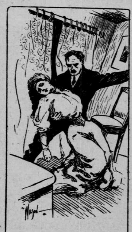
Caught Her a Second Time.

Some of the Advantages. The phenomenal increase in railway mileage—main lines and branches—has put almost every portion of the country within easy reach of culture, schools, markets, cheap fuel and every modern convenience.