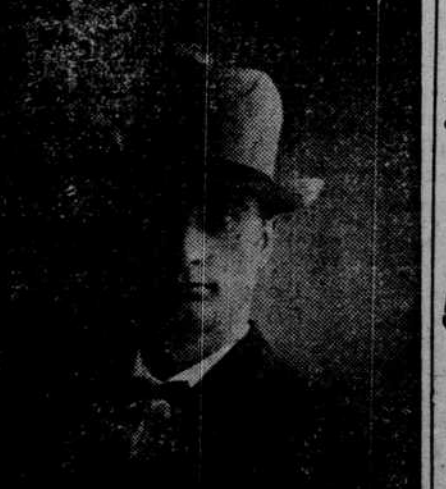
Practical Auctioneer Loup City, Nebr.