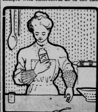
DETECTED BY THE SMELL.

Benzoic acid also is used for preserving fruit products. Extract the sample with chloroform as in the case