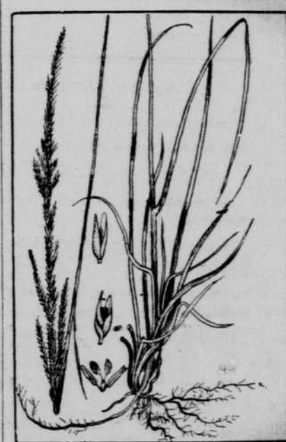
SMUT GRASS (SPOROBULUS INDI-

This grass originated in India, but has now been carried to many other lands. It is found quite abundantly in the southern states. It is called smut