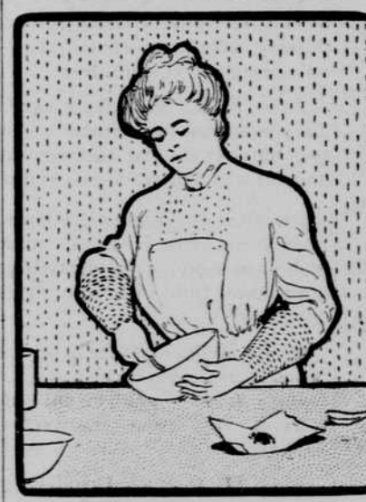
DETECTING BORIC ACID.

About a teaspoonful of the liquid control. We are in the right, backed ly submitting her purchases to this obtained by any one of the methods by the law, while you are trespassers test. Her broad experience develops mentioned above is placed in any dish, and subject to legal vengeance. Once her senses of taste and smell to a not metal, and five drops of hydrofor all I warn you that we are pre- high degree, and her discrimination is chloric (muriatic) acid added. A strip your orders, sir, for all the signs pared to defend our own-if you ad- often sharper and more accurate than of turmeric paper is now dipped into vance upon us it is at the peril of your she herself realizes. The manufacthe liquid and then held in a warm lives-we shall fire upon you, and it turer who has developed his natural place-near a stove or lamp-till dry is known how Americans can shoot senses most highly appreciates best If boric acid or borax was present the assistance or collaboration of the in the sample the turmeric paper be-His brave voice, his confident man- chemist, who can often come to his comes bright cherry red when dry. A ner, combined with the words to relief when his own powers do not drop of household ammonia changes