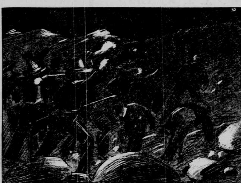
A Flash of Fire Runs Along the Line.

which he gave utterance, strike con- avail. So the housewife, by a few the red color to dark green or green-The very atmosphere has grown sternation to the hearts of many simple chemical tests, can broaden her among the advancing groups; but field of vision and detect many imothers are rendered furious and reck. purities that are not evident to the sides, the bull-like roar of the only DETECTION OF SALICYLIC ACID. One can hear the far away mutter and original Barcelona is now heard: The determination of salicylic acid