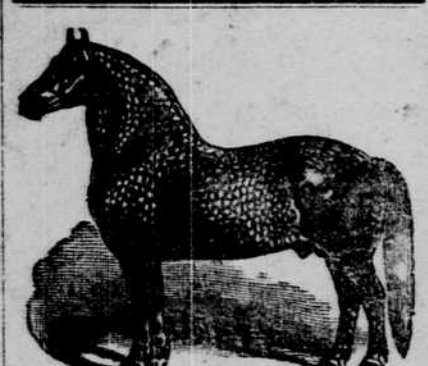
My three stallions and two Jacks Will stand for the season 1906, at the Howe Ranch on Oak Creek, about 8 miles northeast of Loup City. All three horses will be at the old stand in Loup City on Thursday, Friday and Saturday of each week. My terms for the season are to insure colts to live nine days or no day.

Loup City, Ashton Rockville and Schaupps