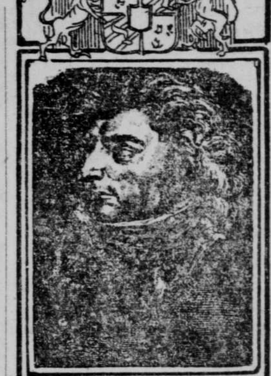
(CHARLES XIV) BERNADOTTE

"I have never found anything so as if in pain. The settler obtained a case anything should happen. Some plays the important part. The first weak solution of borax and water," font which has a romantic history. gun and shot the bird and investigation asked by the young man is said a business woman. Her work re- After standing in the old church for tion showed the cause of its distress gave instructions to a well 'How much?' As a rule, it is an easy quires close application all day and nearly five centuries it is said to have was a weasel which was perched on known French sculptor to prepare a matter to ascertain without applying sometimes many hours into the night, been taken by a farmer and used as a the hawk's back, with its teeth buried design for her monument, and though directly to the papa, but even when and her eyes are, consequently, often cattle trough for fifty years. mal had pounced upon the hawk and hesitated to begin the work, he formal demand there is always a said that for years borax and water to continue her work.