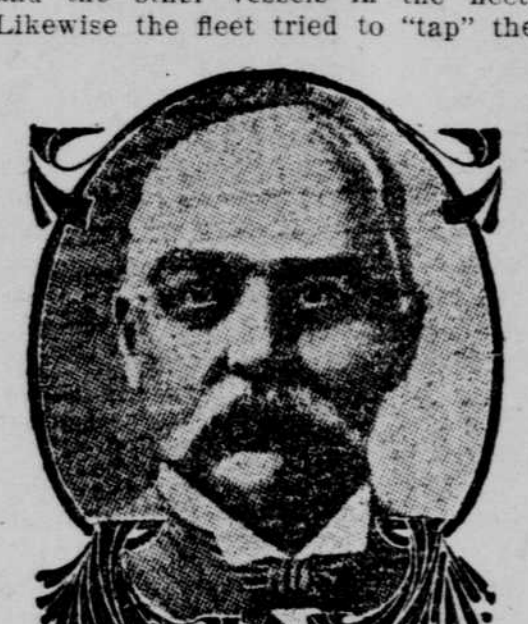
wireless messages passing between

The scene of the army and navy | peake, is a government wireless tele- | could not in any even risk grounding exercises this year was Chesapeake graph station, which also had its in order to pass the upper forts. bay, and, in a measure, the movement | quiet part in the exercises. This was to determine the value of the egency, which was in communication fortifications in preventing a foreign with the forts, naturally endeavored foe from making an attack upon to keep the army informed of the approach of the attacking fleet, and also attempted to "overhear" any wireless Rear Admiral F. W. Dickins was messages passing between the flagship in command of the invading fleet, and the other vessels in the fleet.