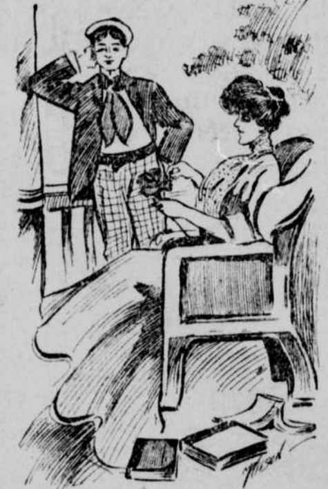
"There is no such thing as Platonic friendship."

The hot days and cool nights rolled by in monotonous success, but the day