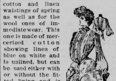
4626 Tucked Blouse, 32 to 40 bust.

Tucked Blouse. Blouse or shirt waists made with tucks arranged in groups are among the designs shown for the advance season and are admirable for the new cotton and linen waistings of spring as well as for the wool ones of immediate wear. This one is made of mercerized cotton showing lines of blue on white and is unlined, but can be used either with or without the fitted lining and is available for all materials in vogue.