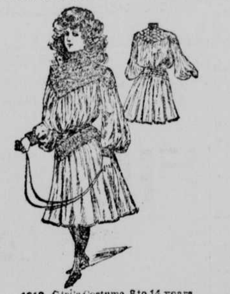
4618, Girl's Costume, 8 to 14 years.

Girls' Costume. Yoke dresses are always becoming to young girls and are shown in many variations. This one is exceptionally pretty and includes a skirt yoke, as well as one in the waist, that gives smooth fit over the hips while allowing fullness below. The original is made of sapphire blue henrietta with the yokes, sleeve caps and cuffs made of narrow bands of silk, interlaced and held by fancy stitches and laid over white, but all the simpler materials of fashion are suitable and the yokes can be of lace silk or any