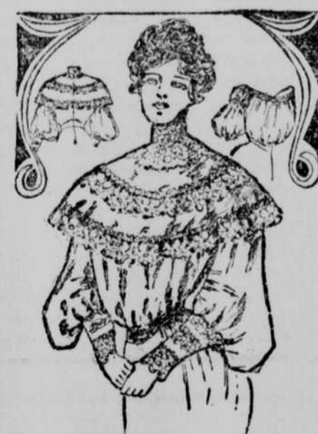
4607 Waist with Fancy Yoke Collar, 32 to 40 bust.

Waist With Fancy Yoke Collar. Every woman knows the value of a gown that can be made high or low neck as occasion demands. This very charming model accomplishes that end and is eminently smart under both conditions. As shown it is made of white crepe meteeore with heavy cream lace as trimming. The yoke-collar is separate and can be worn over the waist made low, as shown