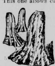
4615 Seven Gored Flare Skirt, 22 to 34 waist.

The seven gored skirt that flares freely and gracefully at the lower portion retains all its vogue in spite of the many novelties introduced. This one allows of either the inverted plaits or habit back, and is trimmed with shaped straps that add much to its style. As shown it is made of nut brown hopsacking, with straps of broadcloth piped with velvet, and is stitched with cordelle silk, but all materials used for skirts and for entire gowns are suitable.