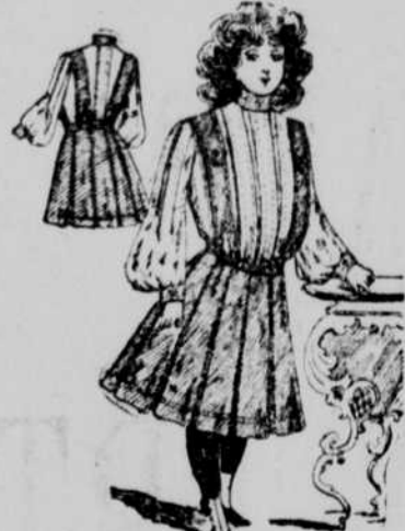
4605 Girl's Box Plaited Suspender Costume, 6 to 12 years.

Suspender frocks make one of the latest novelties for little girls and are exceedingly charming. This one is made with a box plaited guimpe of white lawn, while the dress itself is of rose colored cashmere, stitched with corticelli silk, and is delightful in color as well as style, but the design can be reproduced in any of the