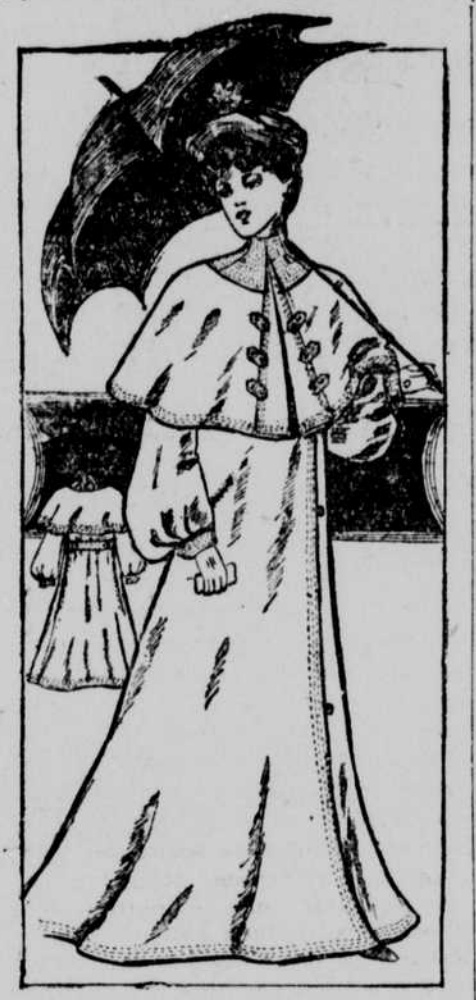
.a Coat. 32 to 40 bust. -Design by May Manton.

Rain coats have become so general as to be counted among the necessities of life. This one is smart at the same time that it serves its purpose well and is suited to all the many waterproof materials in vogue. As shown,