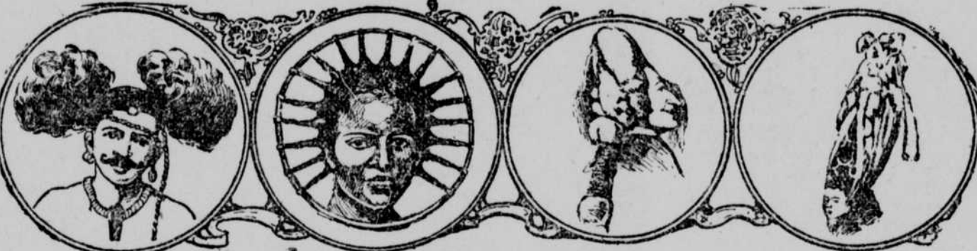
A Savage Chief.

Hair combed back smoothly gives severity even to a kindly face; fluffy hair softens the expression of a hard face.