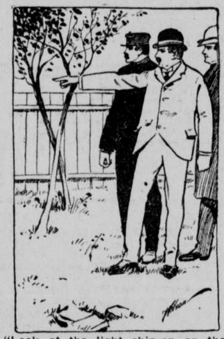
"Look at the light shining on that cellar window!"

"When the confusion incident to the arrival of the boat had somewhat sub-