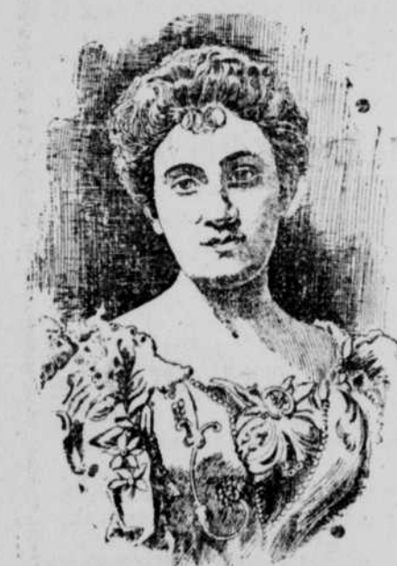
MRS. THEODORE ROOSEVELT.

It was an interesting period in the history of the party and the nation, of his purpose. Every detail of the and young Roosevelt entered upon the political field with eagerness and energy. The purification of political and official life had been for some time an