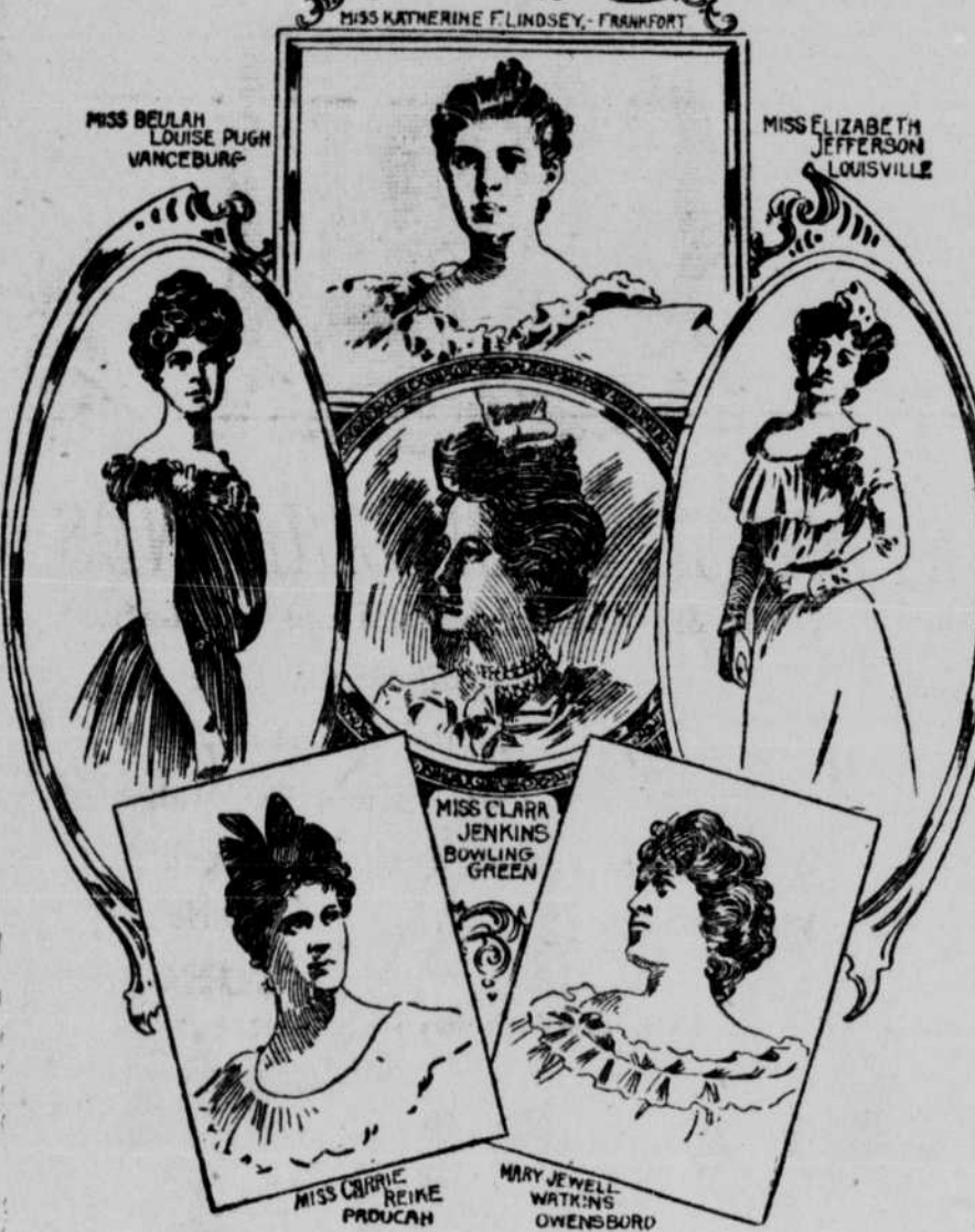
A GROUP OF LADY SPONSORS.

An entertainment fund of over $100 .-000 has been raised, of which $35,000 well-known U. S. army officers. They the city council as a special appropriawill reserve their decisions until at tion. Besides this liberality on the night, when the award of the prizes part of the council, it has further will be made the occasion of a func- agreed to meet practically all the extion at the horse show building, in pense incurred by the committee on tucky will have headquarters. This is which the 27 Kentucky sponsers will public comfort, which will amount to corn. Nine cows died. about another $20,000.