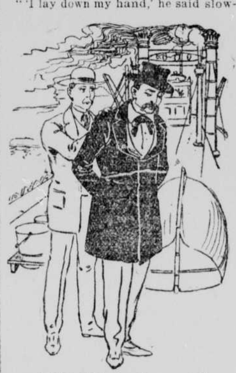
"I loved his mother once."