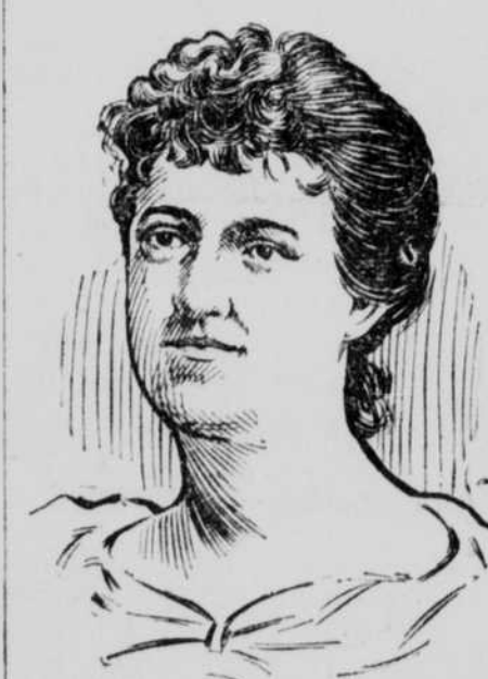
QUEEN OF PORTUGAL.

The wife of King Carlos of Portugal he decided to quit the throne and her