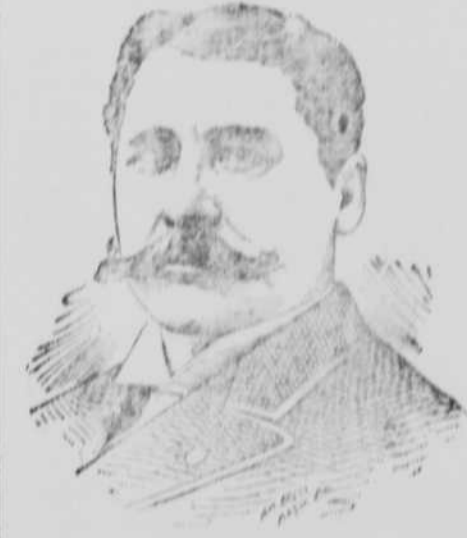
CHARLES H. DIETRICH.

GLOOM AT THE STATE HOUSE. The election of the whole republican state ticket is assured beyond doubt. The state has given McKinley nearly 10,000 plurality and the state ticket is elected by an average plurality of about 1,000. It is certain that the senate will have 18 rep. and 12 fus with a no doubt. The house is made up of 34 rep. and 43 fus with 3 in doubt. Following are the state officers elected: