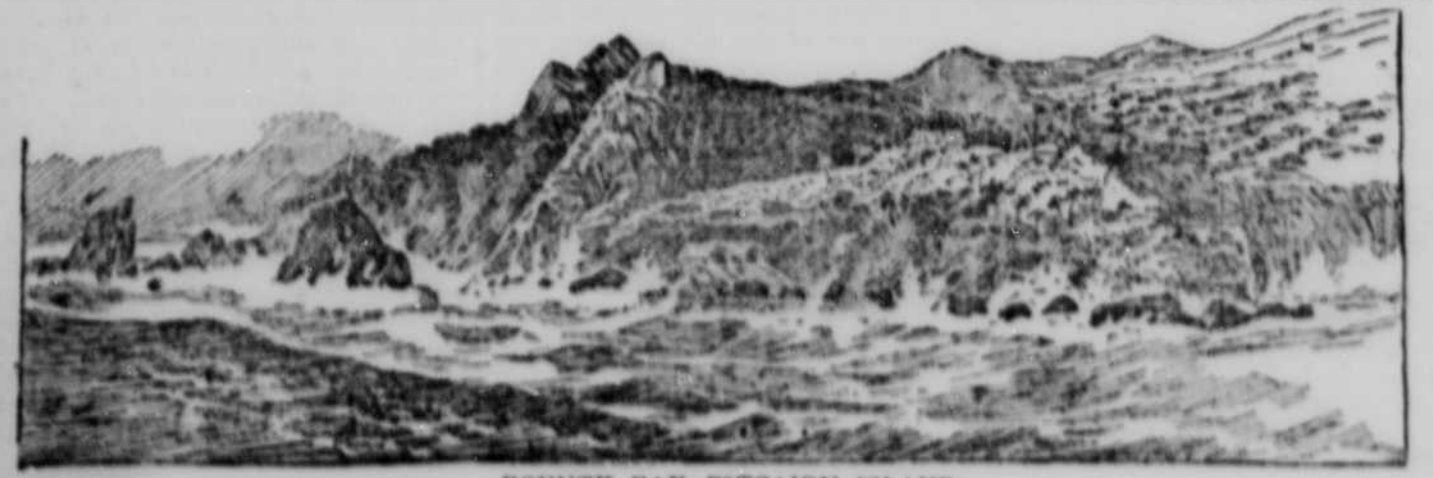
BOUNTY BAY, PITCAIRN ISLAND.