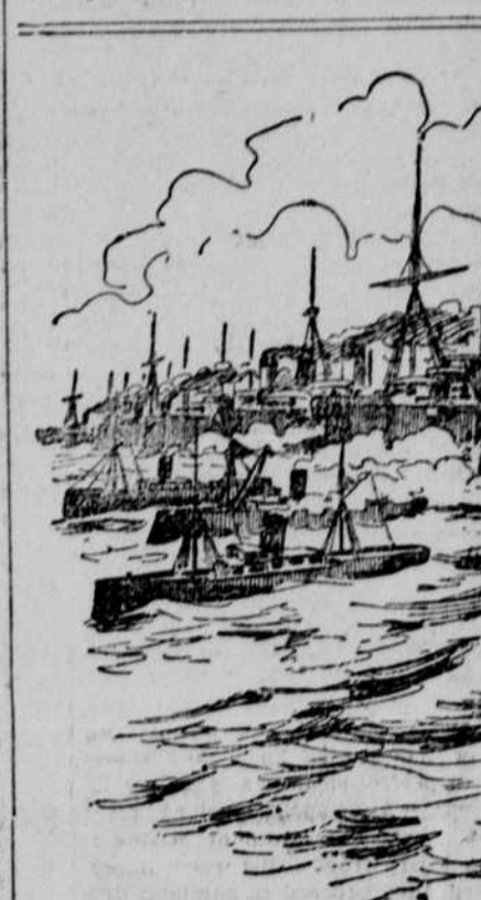
SPAIN'S ASIATIC SQUADRON, ANNIHILATED BY AMERICAN FLEET, UNDER CAPT. DEWEY IN MANILLA HARBOR, SUNDAY, MAY 1.

When the Don Juan blew up a cheer arose from each of the American fleet and again the cry went up, "Remember the Maine. The Maine is avenged." From his post Commodore Dewey gave out his orders and these commands were to keep maneuvering. It was this order which rendered the shots from the Spanish gunners so ineffective.