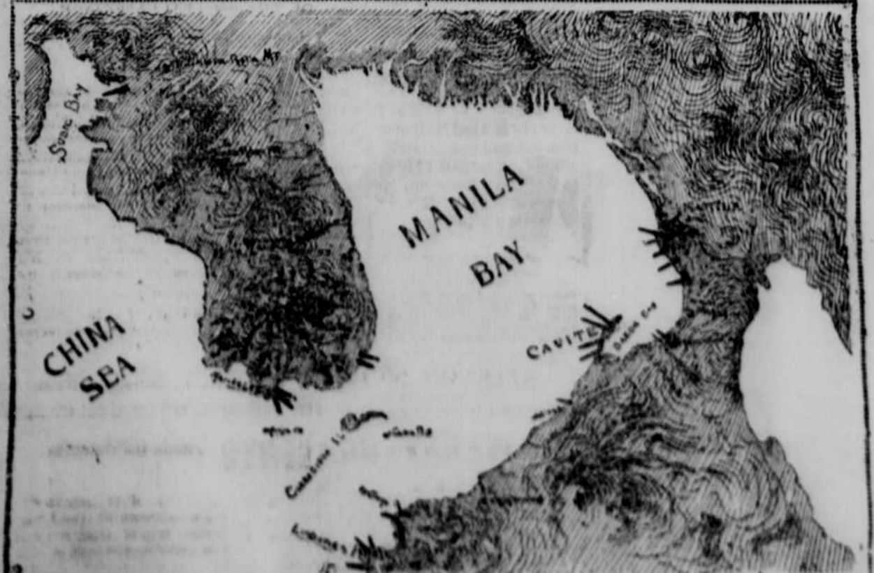
MANILA BAY, PHILIPPINE ISLANDS, IN WHICH THE NAVAL BATTLE BETWEEN THE RESPECTIVE ASIATIC SQUADRONS OF SPAIN AND THE UNITED STATES TOOK PLACE SUNDAY MORNING, MAY 1.

Ask your Grocer to-day to show you a package of GRAIN-O, the new food drink that takes the place of coffee. The children may drink it without injury as well as the adult. All who try it, like it. GRAIN-O has that rich and brown of Mocha or Java, but it is made from pure grains, and the most delicate stomach receives it without distress. (The price of coffee, 15 cents and 25 cents per package. Sold by all grocers.) Tastes like Coffee Looks like Coffee Have that post-growth power GRAIN-O developed in minutes.