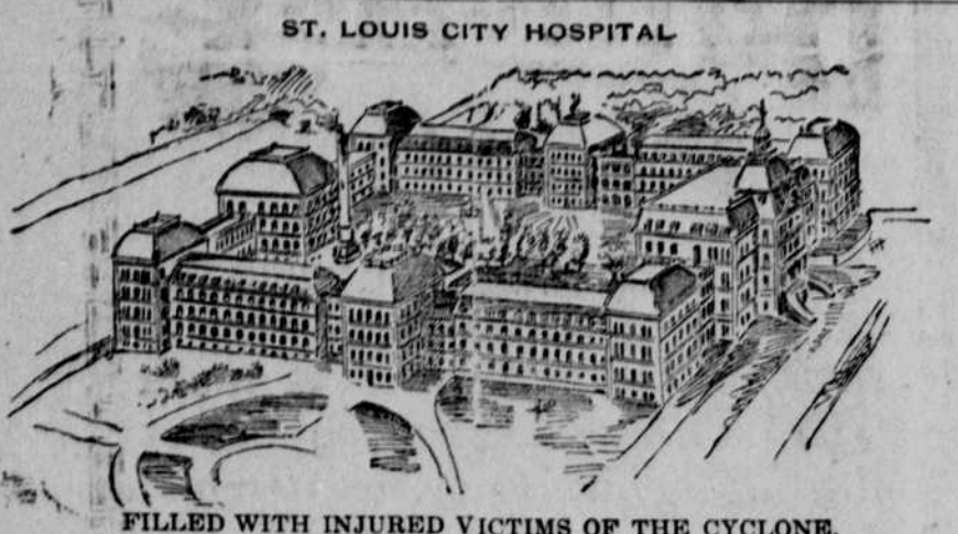
FILLED WITH INJURED VICTIMS OF THE CYCLONE.