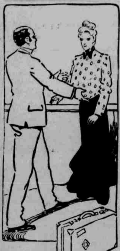
HE HELD OUT HIS ARMS.

Country Life in America. The Rocket was the invention of George Stephenson, whose activities in that line had been stimulated by a premium of 800 pounds for the best locomotive, offered by the Liverpool & Manchester Railway.