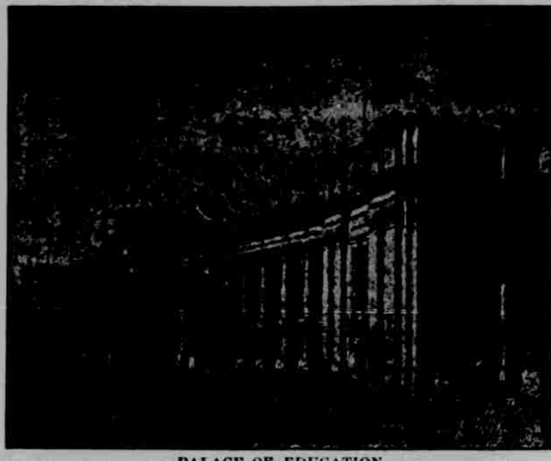
PALACE OF EDUCATION.

to make both ends of the household from three monumental fountains, pluage meet. We are getting on. We have nt down as many cascades a distance of 300 thing. Here's your law of compensa ltor an unrivalled view of the majestic tion again-the joy of service. If one architecture of the splendid structure of