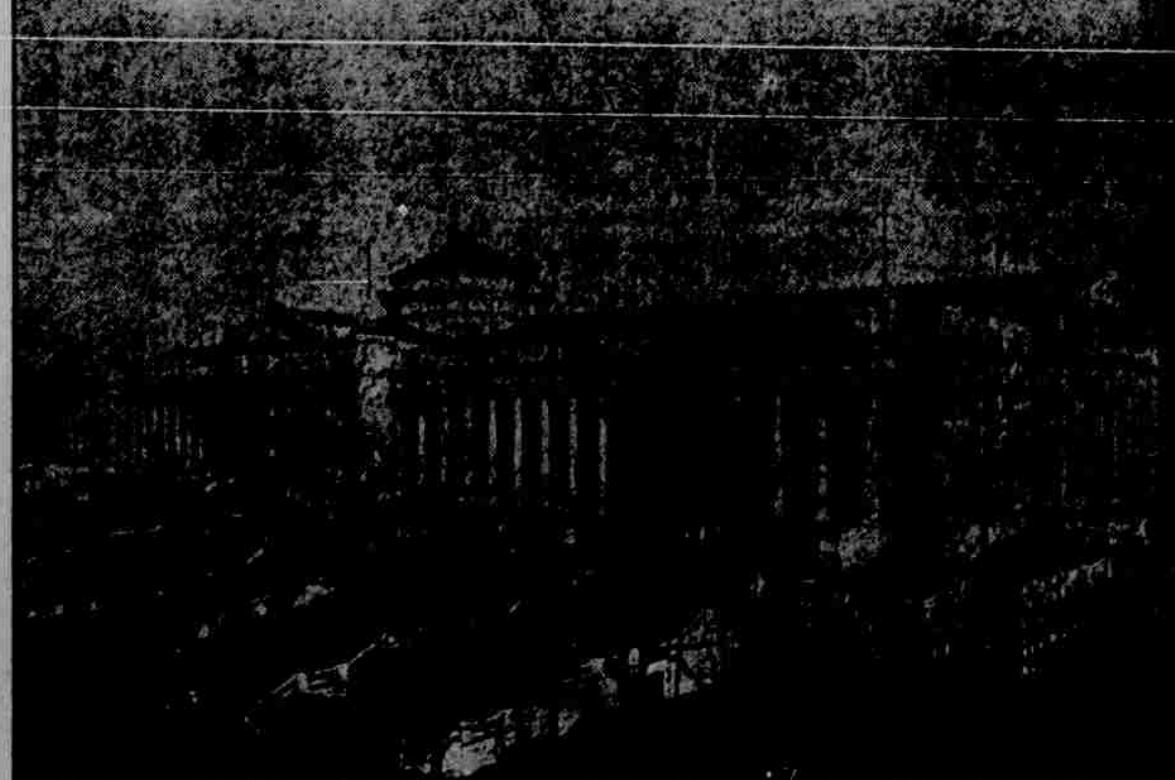
UNITED STATES GOVERNMENT BUILDING.

seting exhibits are made of fish products, Italy has erected a charming villa on