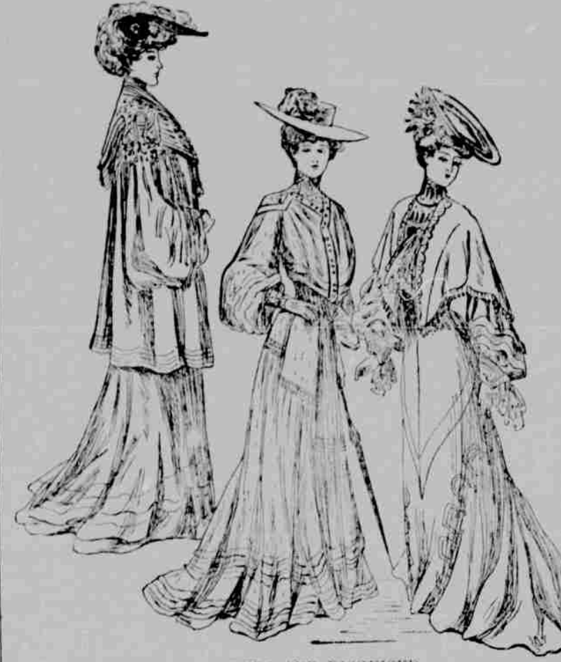
AS SHOULDERS ARE DISGUISED.

so a new buich has been demanded and ated in this respect, and hinted that the been put forward. It consists of the use end of this fashion was near. But for a a variety of ways of fringes and cords once the exaggeration did not foretell a on fur. These friminings may be placed inconspicuously as more edging, or on have become necusioned to this very may consist of design work and orns oddity, and have voted it admirable, con