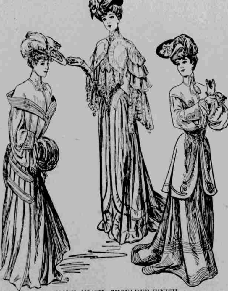
MORE NOVEL SHOULDER FINISH.

dress goods. In the latter manner much more of it. Were there only a few much of this embellishment is very strik- set ways of attaining it, the notion would An ermine lacket finished with have become tiresome long ago, but it is k suk earl and ornaments in liberal secured in so many widely different capply will stand out as new, you may ways that there's no sameness to it. So depend. What is hastening the replacing of two for combinations is the opportion, and each woman in nearly her own making good use of particular way. It is in this great oppor-tually for individuality that the hold of any, though making over in furs is cost the fancy on women's favor lies. Then all such suspicion, according to those who numerous moderate responses to the or fashions. In millinery, fur trimmed style. The cosmines remaining in to nats are many, and the amount of fur day's illustrations present it variously to the last is considerable, but rarely is In the model at the middle of the second he all for hat seen, as they are deemed picture it comes in an extension on to the mitable only for severe weather. The shoulder of the yoke. This gown wa ight colored furs have the call for head gray mixed suiting and black cord. Be wear, ermine, mole chinchilla and squir- side it is an example of slope gained through a cape, a frequent resort, espe-Coats are so elaborately made that the cially in pronounced models.