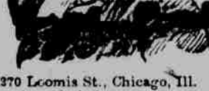
370 Leomis St., Chicago, Ill.