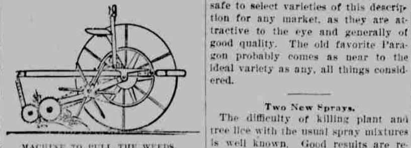
MACHINE TO PULL THE WEEDS.

A Weed Puller. Another machine has been invented for the use of the farmer. The picture shows the invention doing its work, and gives an idea of the mechanism by which it is operated. Two fluted rollers are mounted on an adjustable support at the rear of a sulky, with chain gearing to rotate them rapidly as the machine is drawn over the ground. As the flutings on the face of the rollers mesh closely together, it is easy to understand how any weed or grass which once gets between them will be drawn up, until it is finally lifted out of the ground, roots and all. To insure the killing of higher growths, the machine